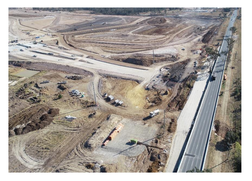
Badgerys Creek Road Realignment at Elizabeth Drive, August 2019

We look forward to working closely with our neighbours as we work to deliver Early earthworks for Western Sydney International and will continue to update you as work progresses with the construction of the Airport.