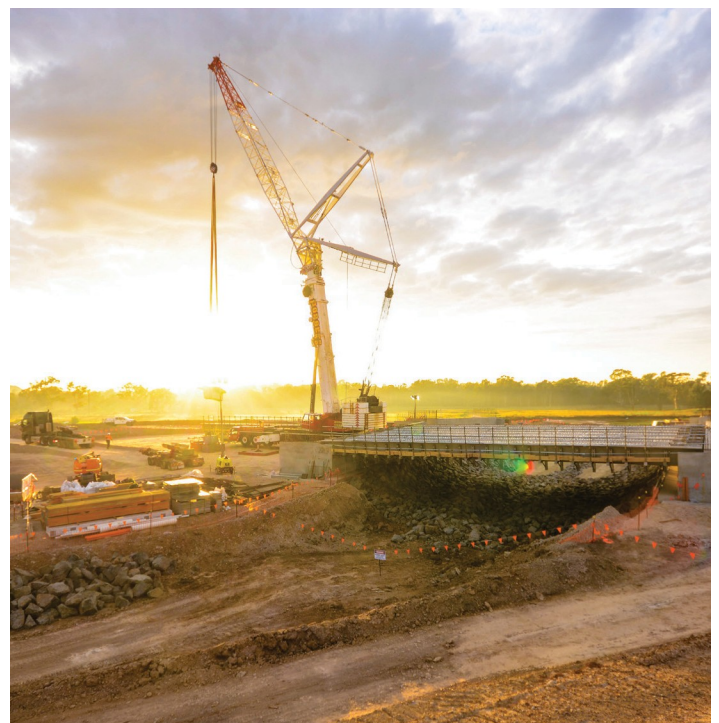
Bridge installation, May 2019

We look forward to working closely with our neighbours as we work to deliver Early earthworks for Western Sydney Airport and will continue to update you as work progresses with the construction of the Airport.