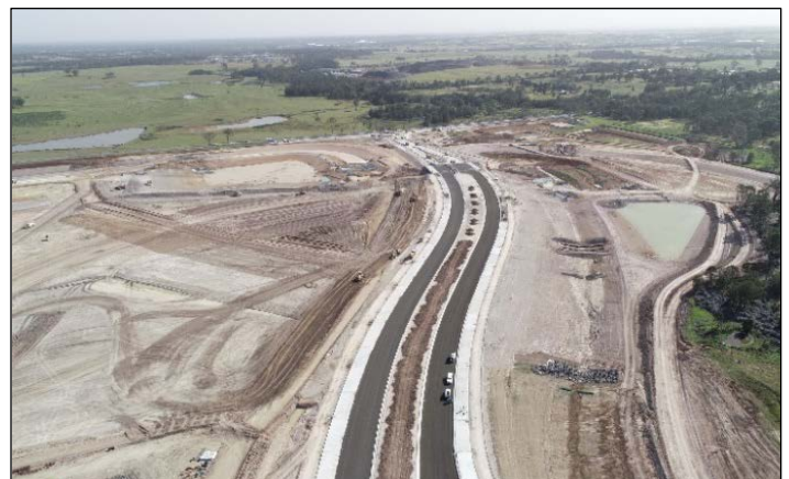
Early earthworks November 2019

We will continue to keep you updated as work progresses.