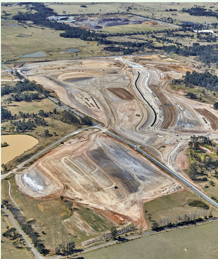
Progress on early earthworks

Preparation work for bulk earthworks will continue from October until the end of 2019. The work includes survey, investigation and salvage work, minor earthworks and clearing, construction of temporary facilities, and removal of redundant services.