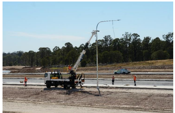
Street lighting installation on Badgerys Creek Road, November 2019

The project will be shut down from Saturday, 21 December to Wednesday, 1 January 2020. Essential utilities works will be carried out from Thursday 2 January to Sunday 5 January . These works will not be noisy and there will not be any disruption to services. If you need assistance during this time, please call the Community Line on 1800 951 171.