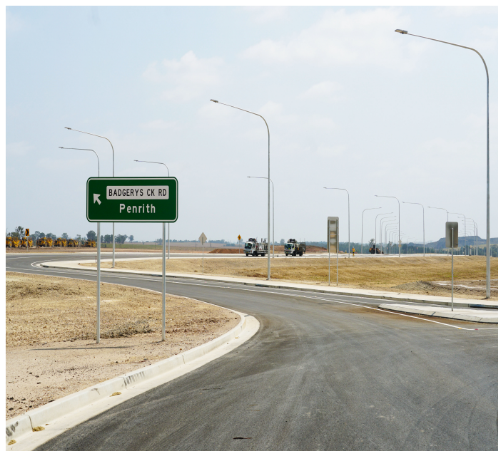
Badgerys Creek Road re-alignment and signage

Changed traffic conditions continue to be in place on Badgerys Creek Road and Elizabeth Drive. Please keep to the speed limits, follow the direction of traffic controllers and electronic signs and allow additional travel time. We thank motorists for their patience during this work.