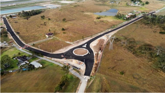
Progress of the new round-a-bout at the Adams Road and Anton Road intersection, taken August 2022

We are continuing to work closely with utility providers who are upgrading services along Adams Road at the same time as our work, in an effort to minimise disruption to residents and the local community.