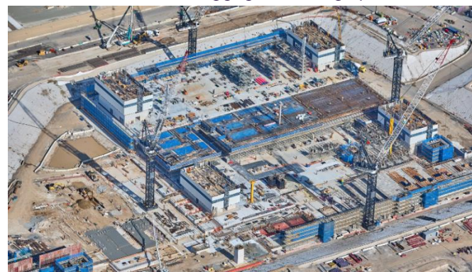
Aerial photo of the terminal building, taken August 2022